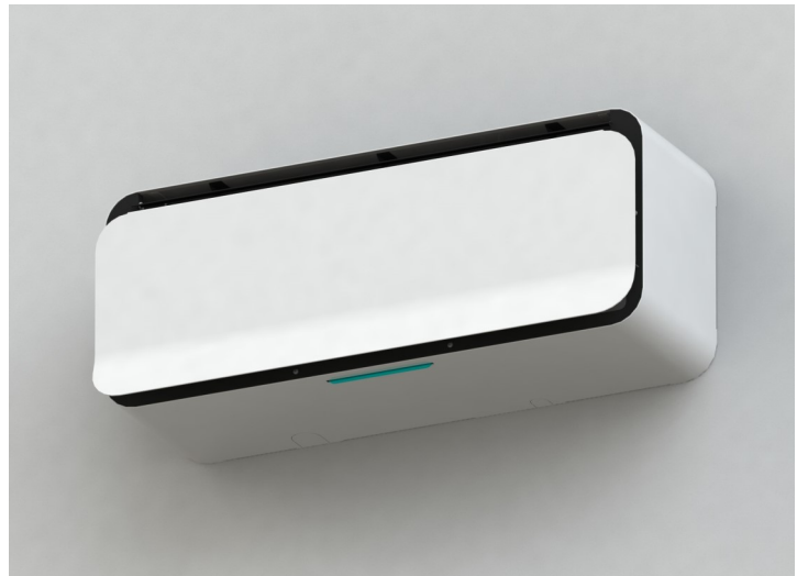
HWD-45 Horizontally Mounted

Introducing the Innovative military grade, TAA compliant, Vertical (VWD-30) & Horizontal (HWD-45) Wall Mounted Dehumidifiers. Our highly engineered Defender Series Dehumidifiers are uniquely designed to attack high humidity in your military applications, improve Indoor Air Quality (IAQ) and protect military assets.