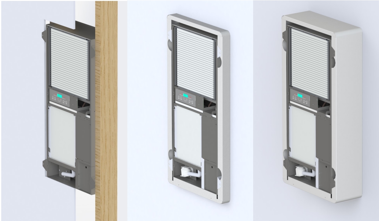
Fully recessed cabinet mounting.