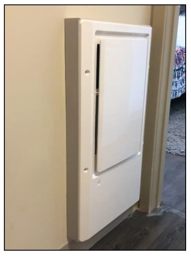
IW25-5 In Wall Dehumidifier installed with Exterior Sleeve and cover.