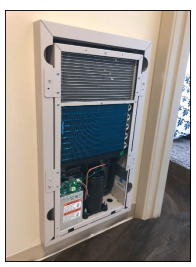
Exterior Sleeve installed with IW25-5 IN Wall base unit and mounting tabs.