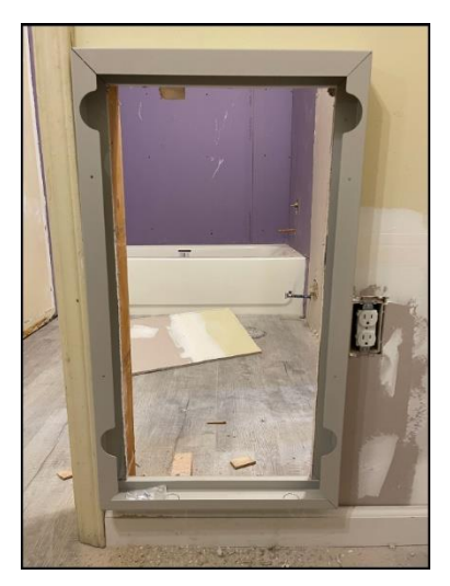
Exterior Sleeve installed with rough opening cut out of 2 x 4 wall.

Exterior Sleeve Dimensions: 17.5" W x 30.5" H x 2.2" D